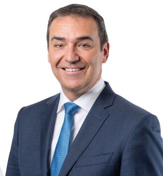
Hon Steven Marshall MP PREMIER OF SOUTH AUSTRALIA

With pleasure, I welcome you to Adelaide